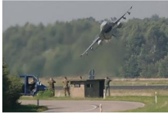
Outlaw low level, at range near Corpus Christi